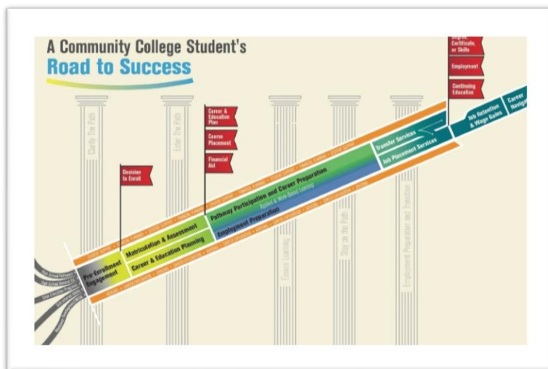
Figure 2: A Community College Student's Road to Success