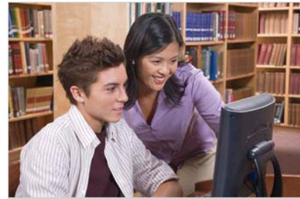
Librarians help people find information and conduct research for personal and professional use.